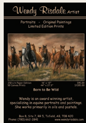
Sample page from the Oct/Nov 2008 Canadian Cowboy Country magazine